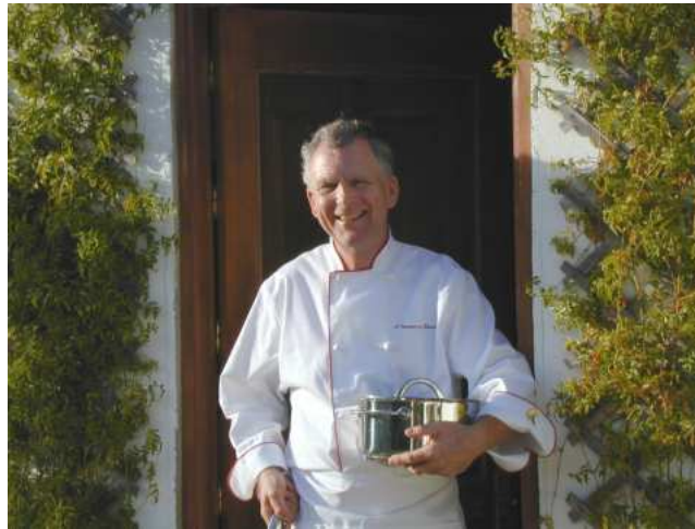
Culinary & Cultural Learning Vacations in southern Spain